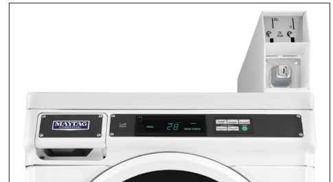
CANADA COIN DROP EQUIPPED MHN33PDCXW (pictured)