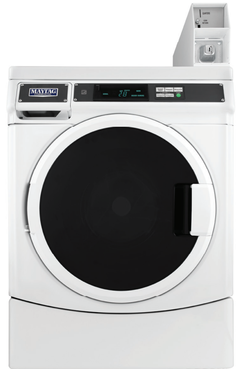
COIN DROP EQUIPPED MHN33PDCWW (pictured)