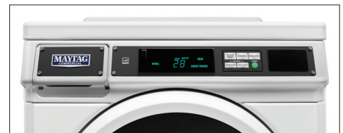
CARD READER READY & NON-VEND MHN33PRCWW (pictured)